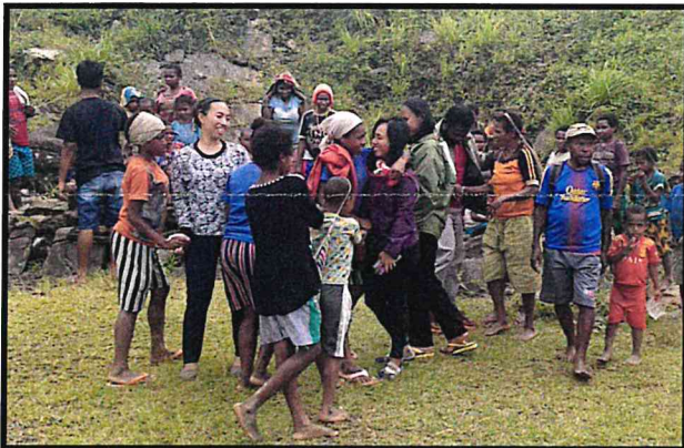
Supporting health workers

In Hosea God says, "For I desire mercy not sacrifice, and acknowledgment of God rather than burnt offerings." May we show mercy and acknowledge God to those around us each day.