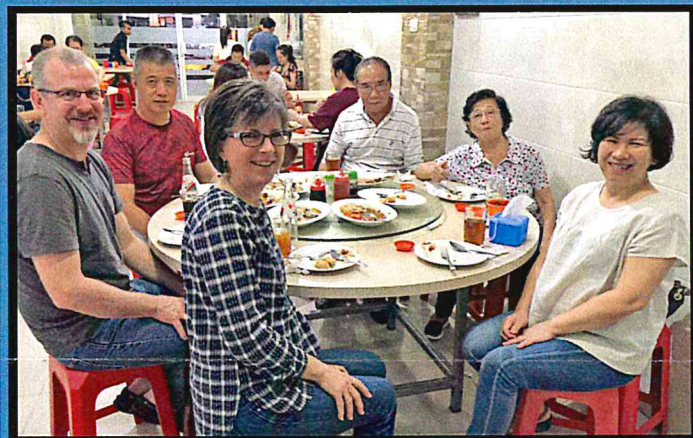
Grateful for friendships!

Mission Aviation Fellowship PO Box 47 Nampa, ID 83653 USA