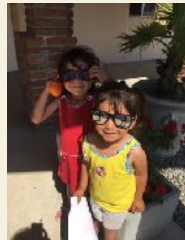
^New sunglasses, just so cute! Don't you agree?