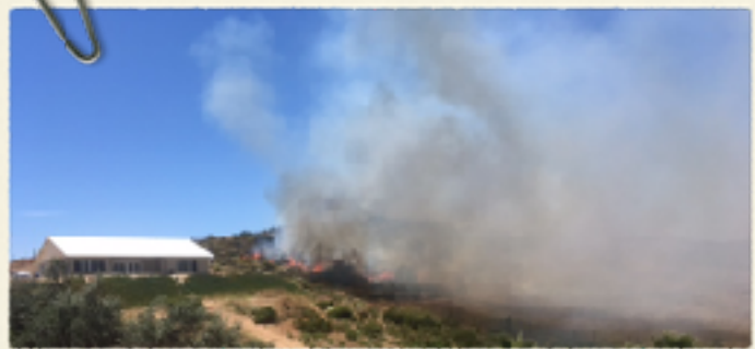
May 26, 2017 FIRE, FIRE, FIRE!