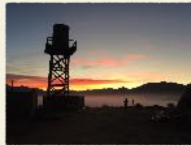
Sunrise at MoO